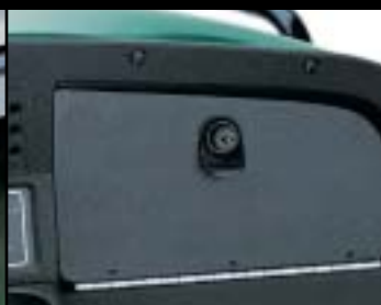
Locking Glove Box