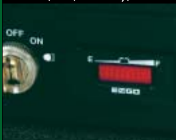
State of Charge Meter (Electric Models Only)