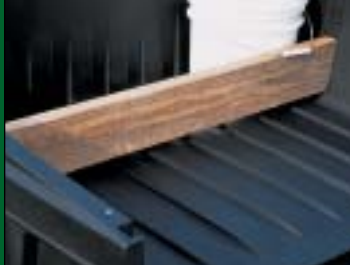
Divider slots/Threaded Inserts (1000/1200 Only)