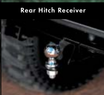
1 7/8" Ball Hitch