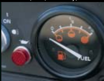
Fuel Gauge (Gas Models Only)