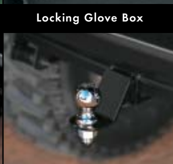
1 7/8" Drop Ball Hitch