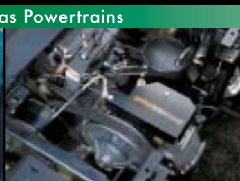
1200G 11 hp Powertrain