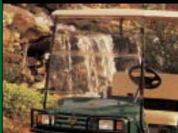
Top and Windshield