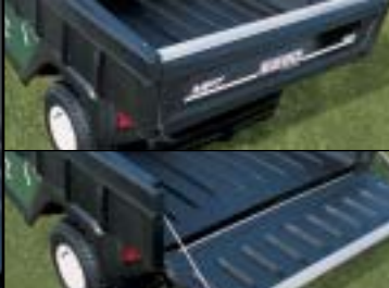
Multi-position Tailgate (1000/1200 Only)