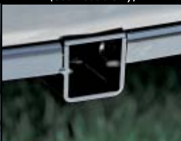
Rear Hitch Receiver