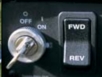
**Dash Mounted FNR Switch (1000 Only)